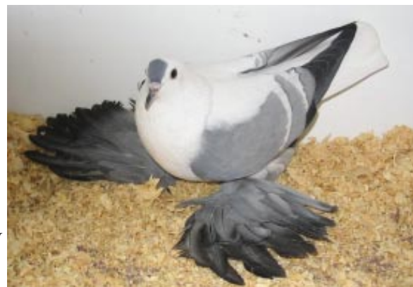
Best Silesian Swallow, Blue W/B YH bred by Darren Rafton