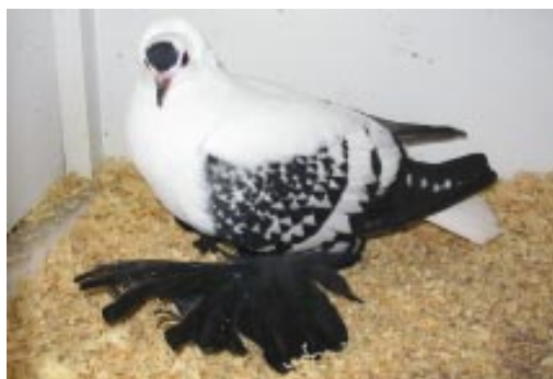
Black Spangle Saxon Fairy Swallow bred by Darren Rafton