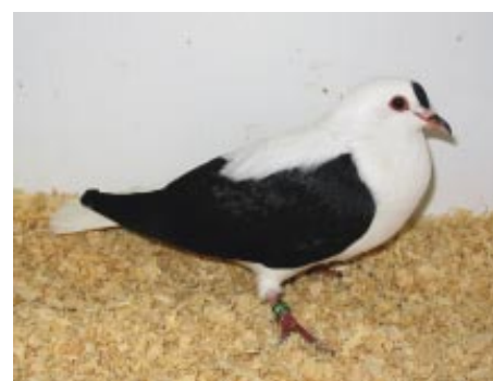
Best Clean Leg Swallow bred by Darren Rafton