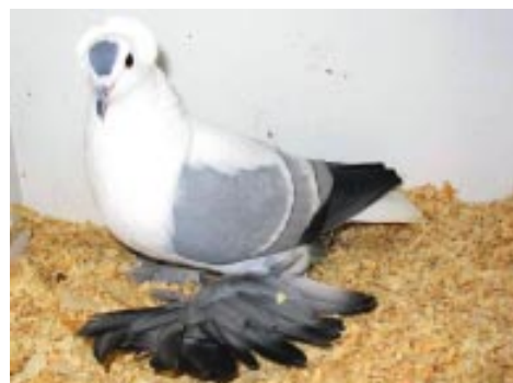
Best Blue W/B Fairy bred by Darren Rafton