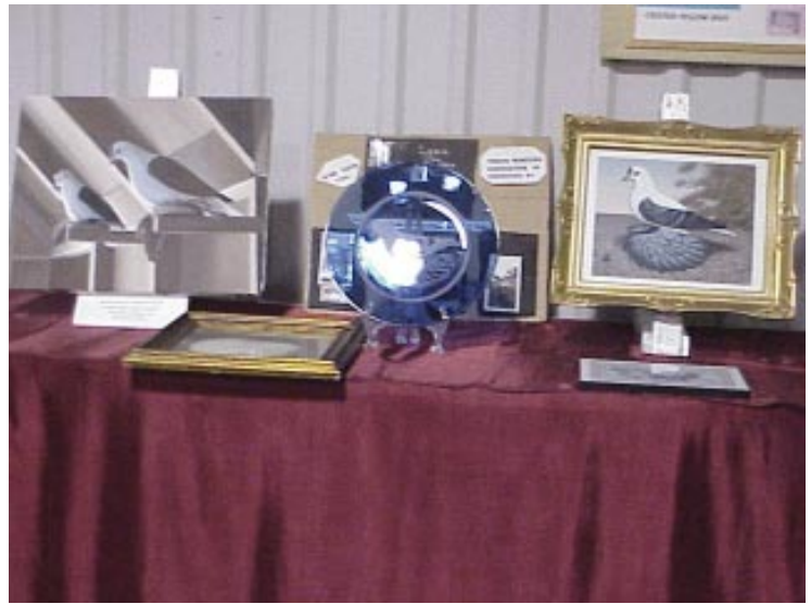
Display of Swallow Art at the Rochester Show.