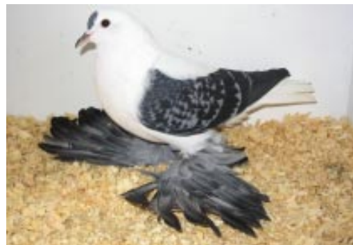
Blue Check Silesian Swallow bred by Darren Rafton