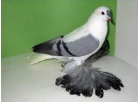
Reserve Champ Swallow- Dave Harris Rated "E"