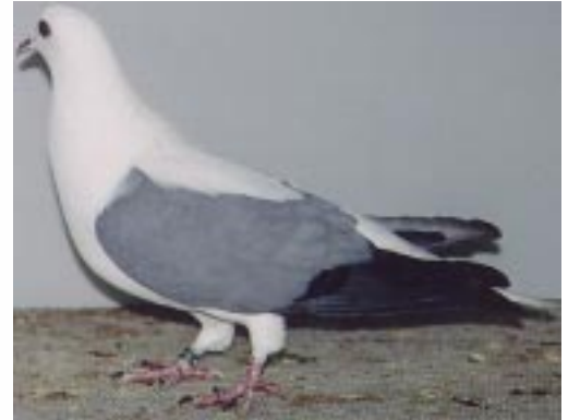
Best barless Thuringer Wing Pigeon and Reserve Champ - Bernd Licht Rated "E"