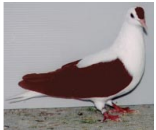
Best Red barless Thuringer Wing Pigeon - TNT Lofts Rated "HS"