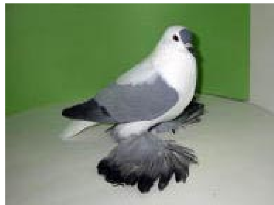
Champion Swallow OC #900 rated "E" Bred by Gloria Weisgram