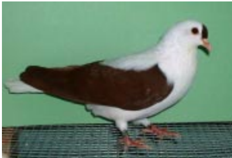
Best Thuringer Spot Swallow and Best Red or Yellow -Tim Starr. Rated "E"