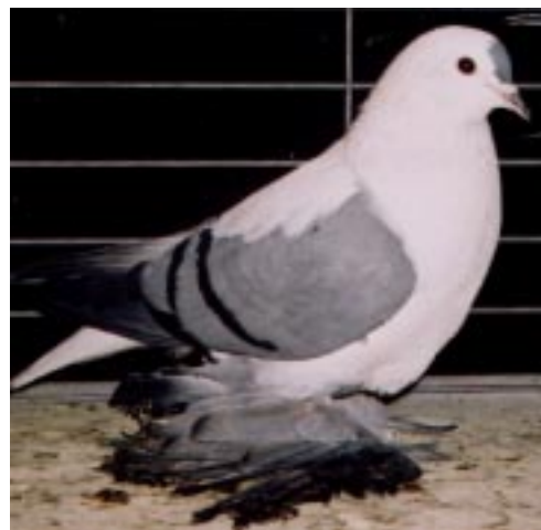
Blue Black Bar Silesian Swallow Champion Swallow -John Taupert rated "E"