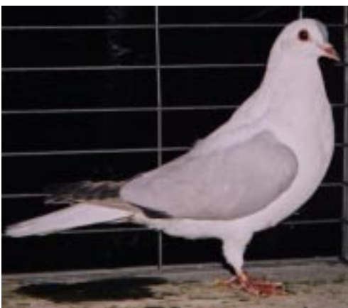
Silver barless Thuringer Wing Pigeon Reserve Champ -TNT Lofts rated "E"