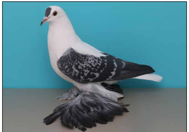
** Reserve Champion Blue Check, OC 158 E-97, Mike Swanson