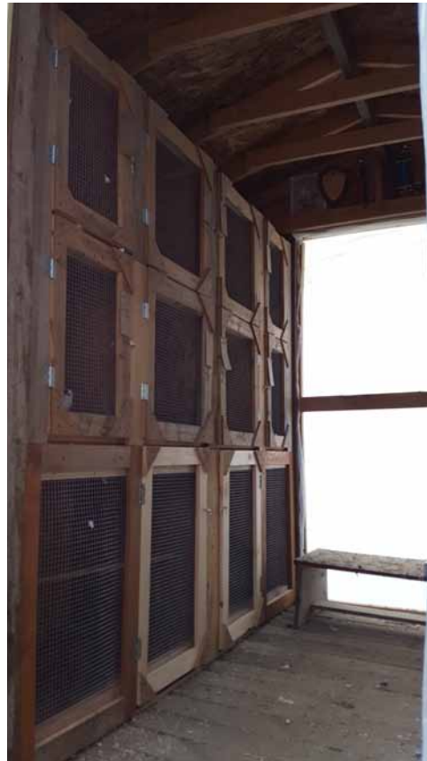
Jim Grober Condition pens