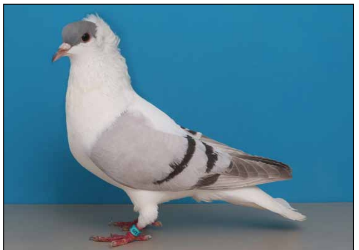
* Best Thuringer Swallow, Silver Dun Bar, OC 429 HS-96, Brad Stuckey