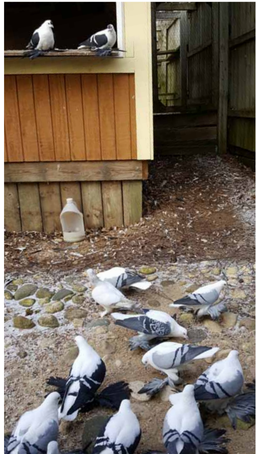
Jim Grober Swallow Loft birds feeding