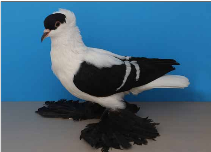
Saxon Fullhead Swallow Black White Bar YC 894 Chris Auer