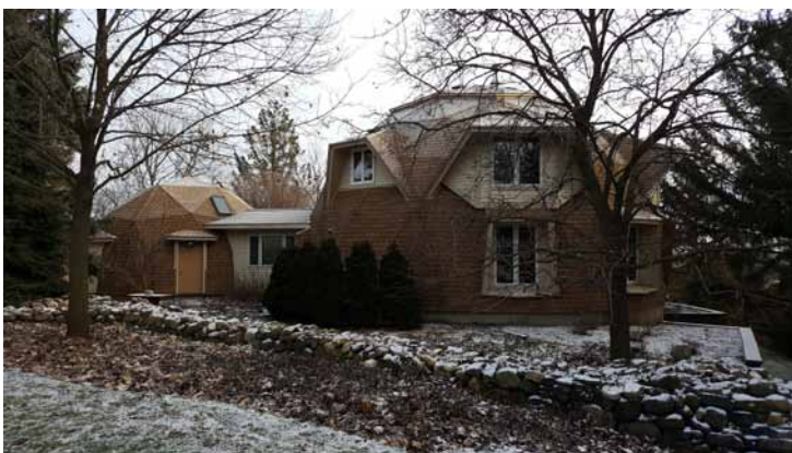
Jim Grober House