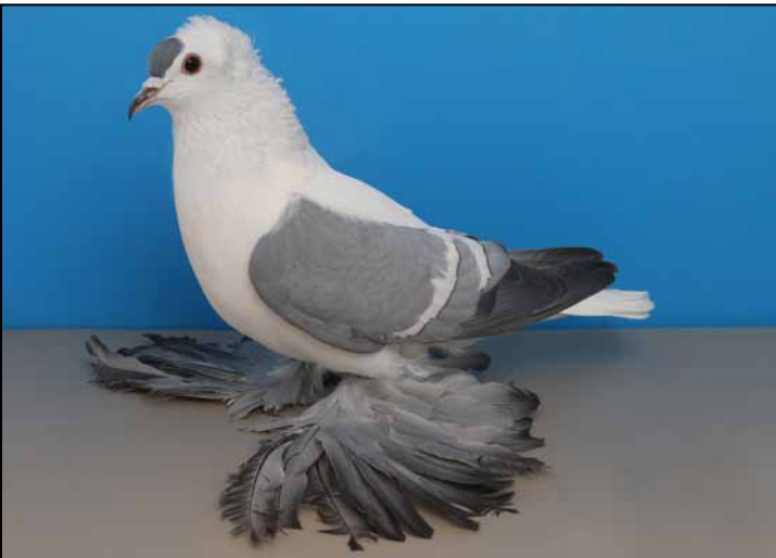
* Best Fairy Swallow Blue White Bar, OC 124 *E97, Mike Swanson