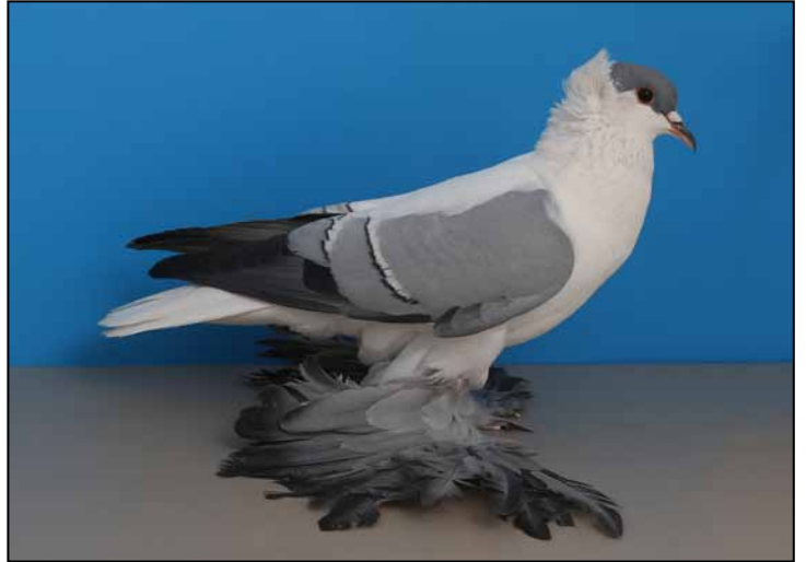
* Best Saxon Fullhead Swallow Blue White Bar, YC 19-964 HS-96, Perry Mueller