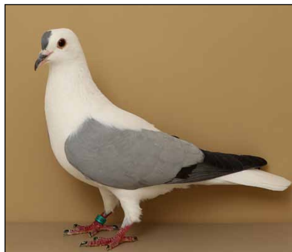
* Best Thuringer Wing Pigeon