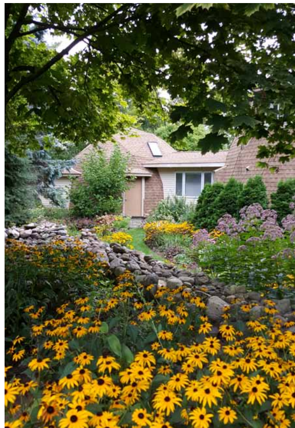
Jim Grober Summer landscaping