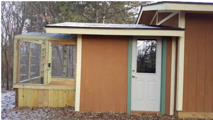
Gold Collar new loft