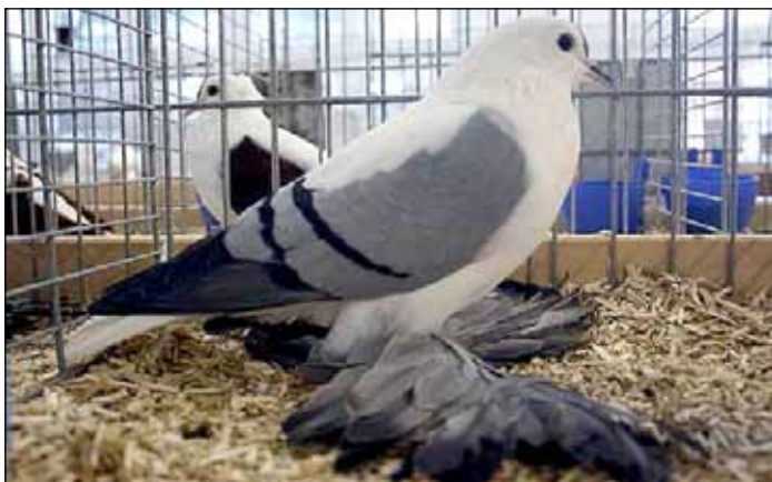
Saxon Silesian Swallow Blue black barred Rated E-97, Bernd Ehrler Photo from Zwönitz 2012 by Andreas Reuter