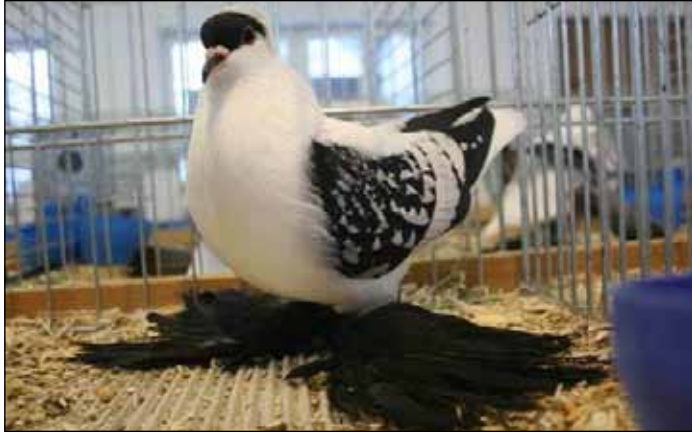
Saxon Fullhead Swallow Black Spangle Rated S-95, Klaus Hentschel Photo from Zwönitz 2012 by Andreas Reuter