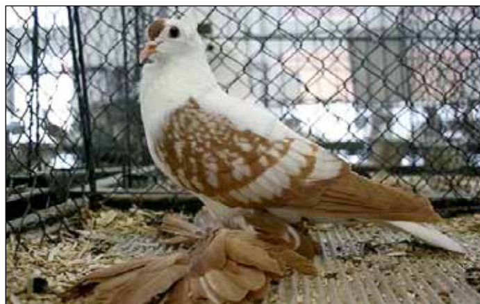
Saxon Fairy Swallow Yellow Spangle Rated E-97, Klaus Burkhardt Photo from Zwönitz 2012 by Andreas Reuter