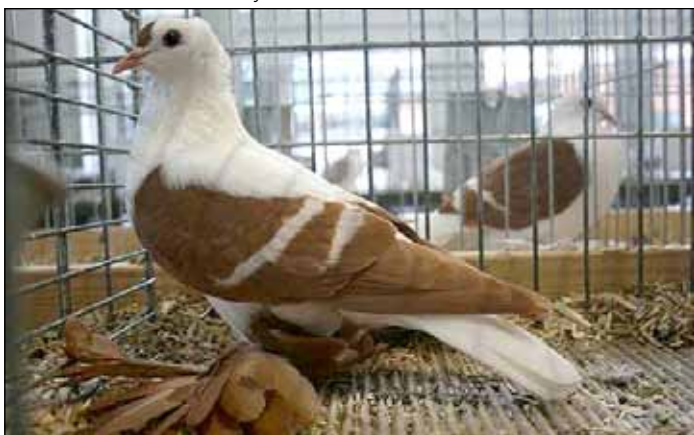
Saxon Fairy Swallow Yellow White barred Rated E-97, Stephan Groschupp Photo from Zwönitz 2012 by Andreas Reuter