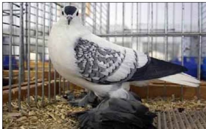
Saxon Silesian Swallow Blue Spangle Rated HS-96, Bernd Ehrler Photo from Zwönitz 2012 by Andreas Reuter