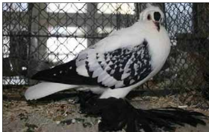
Saxon Fairy Swallow Black Spangle Rated E-97, Horst Schmidt Photo from Zwönitz 2012 by Andreas Reuter