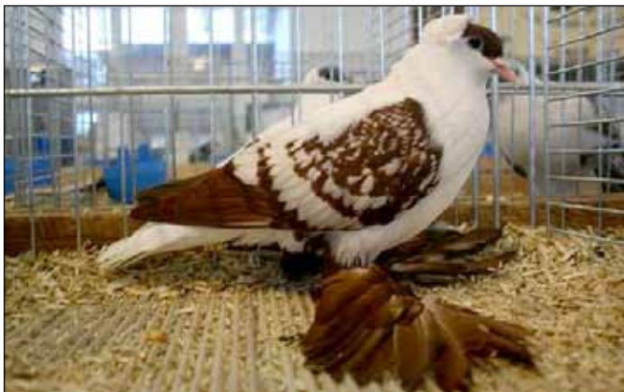
Saxon Fullhead Swallow Red Spangle Rated S-94, Klaus Hentschel Photo from Zwönitz 2012 by Andreas Reuter