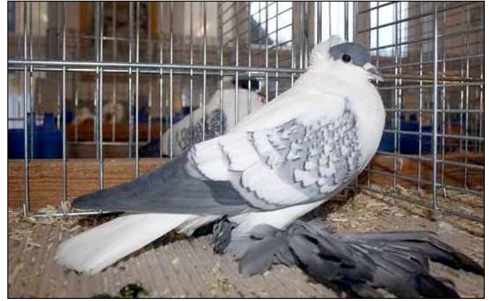
Saxon Fullhead Swallow Blue Spangle Rated E-97, H.-Ulrich Lemnitz Photo from Zwönitz 2012 by Andreas Reuter