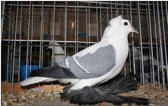
Saxon Fairy Swallow Blue White bar Rated E-97, Cor van der Post Photo from Zwönitz 2012 by Andreas Reuter