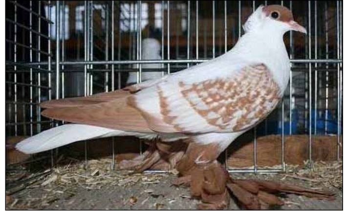
Saxon Fullhead Swallow Yellow Spangle Rated E-97, Klaus Hentschel Photo from Zwönitz 2012 by Andreas Reuter