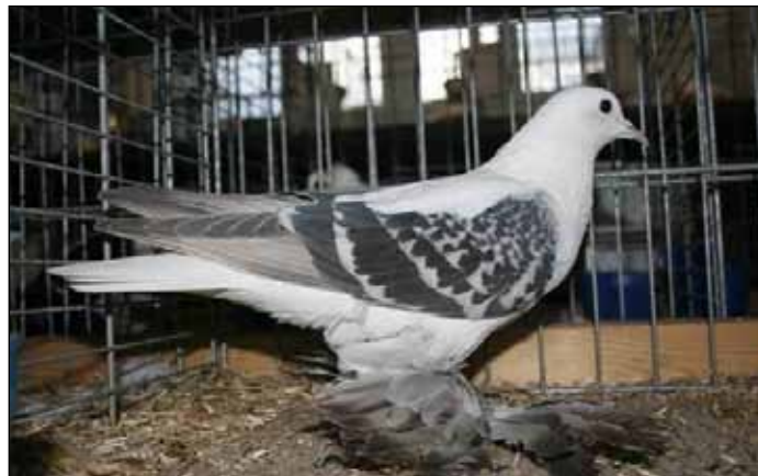
Saxon Silesian Swallow Silver Checker Rated E-97, Dieter Junghänel Photo from Zwönitz 2012 by Andreas Reuter