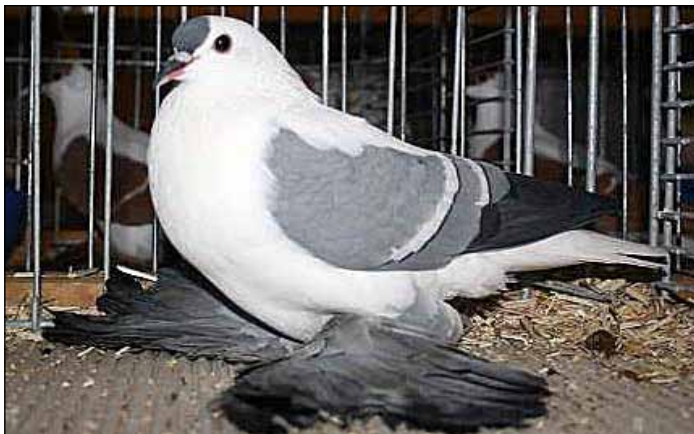
Saxon Silesian Swallow Blue White barred Rated E-97, Michael Gallasch Photo from Zwönitz 2012 by Andreas Reuter