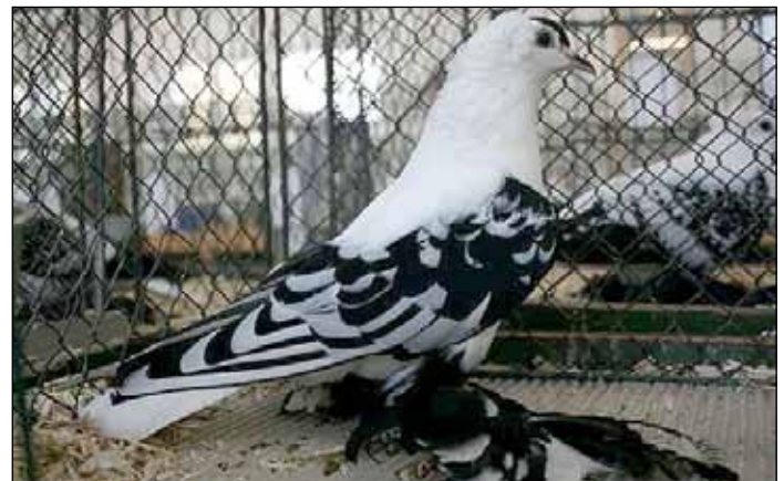
Bohemian Tiger Crested Swallow, Black Rated E-97, Franz Oppl Photo from Zwönitz 2012 by Andreas Reuter