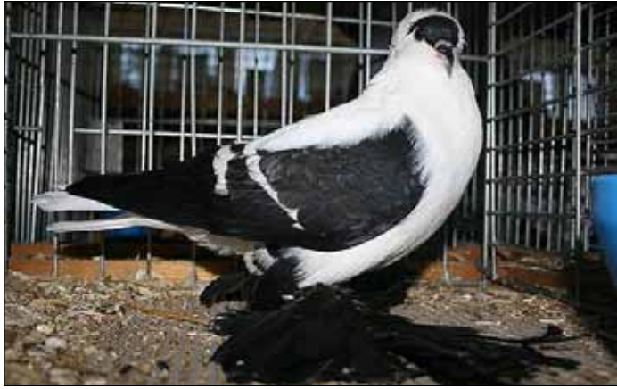
Saxon Fullhead Swallow Black White bar Rated HS-96, Klaus Hentschel Photo from Zwönitz 2012 by Andreas Reuter