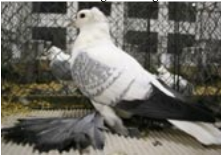
Blue spangled Saxon Wing Pigeon 96, Erhard u. Jonas Wolf