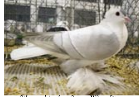
Silver white bar Saxon Wing Pigeon 96, Jörg Kühne