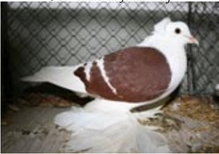
Single crested red white bar Saxon Shield 97, Helmut Löser