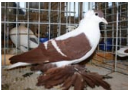
Red white bar Saxon Swallow 97, Klaus Hentschel

January 10 & 11 2009