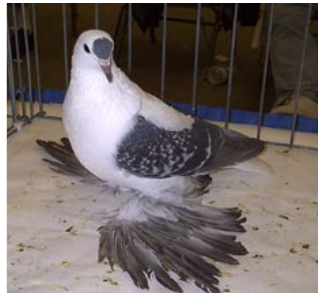
Best Young Swallow 2002 USC Annual meet in Des Moines