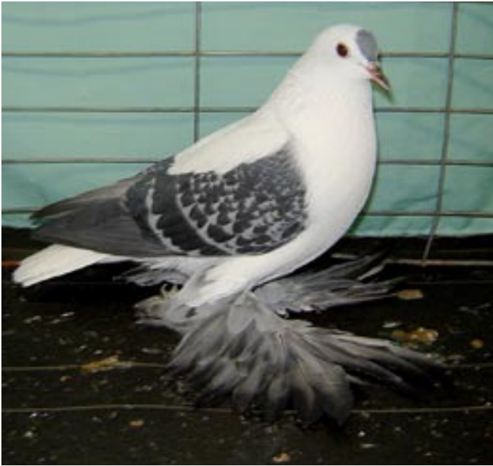
Blue check 2007 Champion at the NYBS.