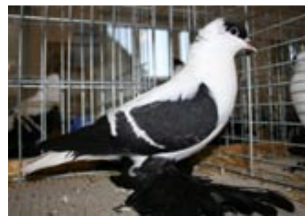
Black white bar Saxon Swallow 97, Jörg Pöttsch