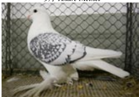
Plainheaded blue spangled Saxon Shield 95, Werner Grund