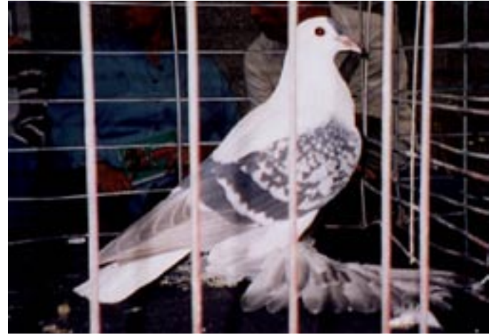
2003 NYBS champion Silver Check