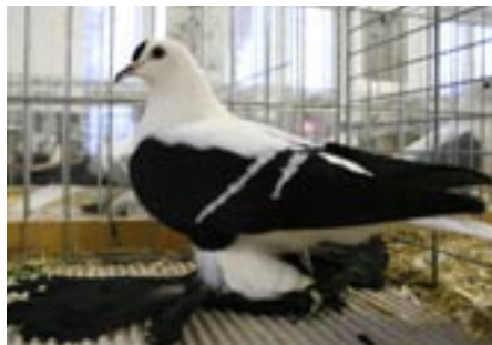
Black white bar plainhead Saxon Wing Pigeon 95, Wolfgang Merk