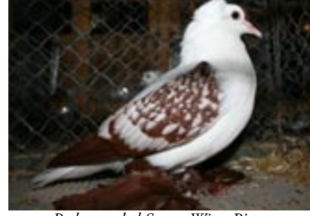
Red spangled Saxon Wing Pigeon 97 Jürgen Noll