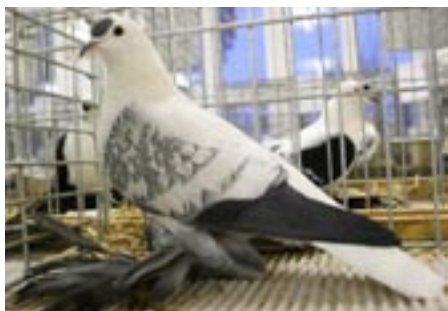
Blue spangle plainhead Saxon Wing Pigeon 96, Christoph Klemm