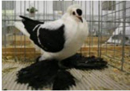
Black white bar Saxon Wing Pigeon 97, Egbert Bierig