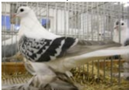
Silver check plainhead Saxon Wing Pigeon 97, Karl Wünsche