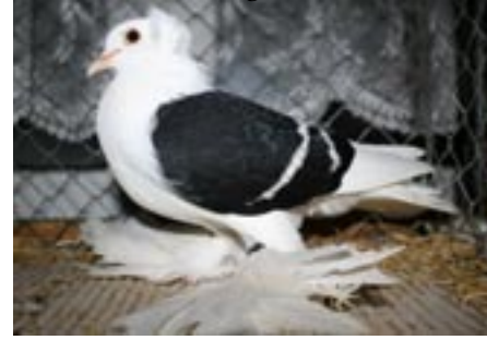
Single crested black white bar Saxon Shield 96, Günter Priemer