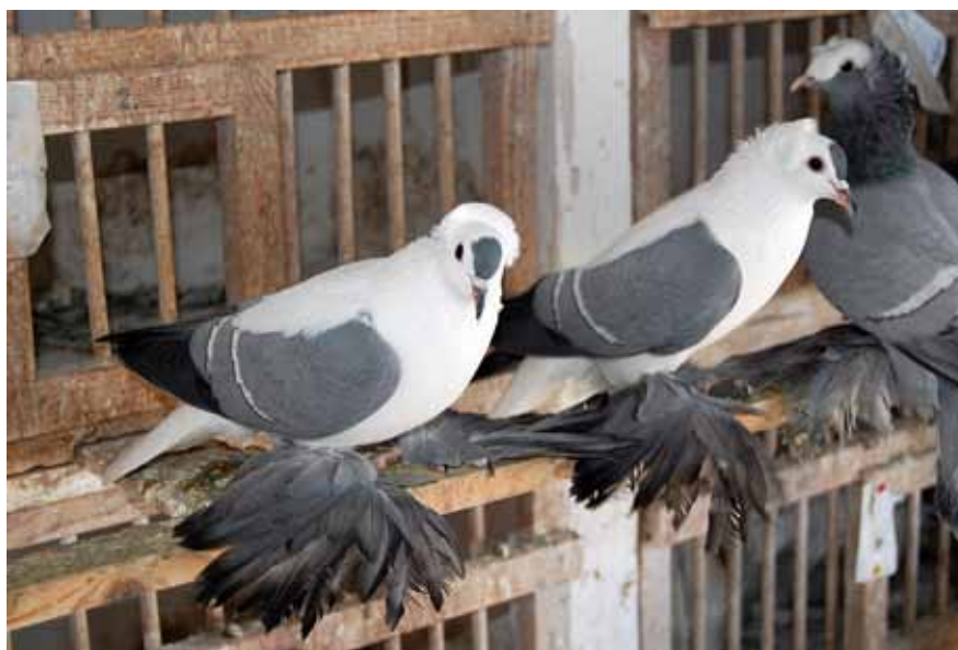
A beautiful pair of Reiner's blue white barred fairy swallows and blue Priest. Photo: Gary Romig January 2011.