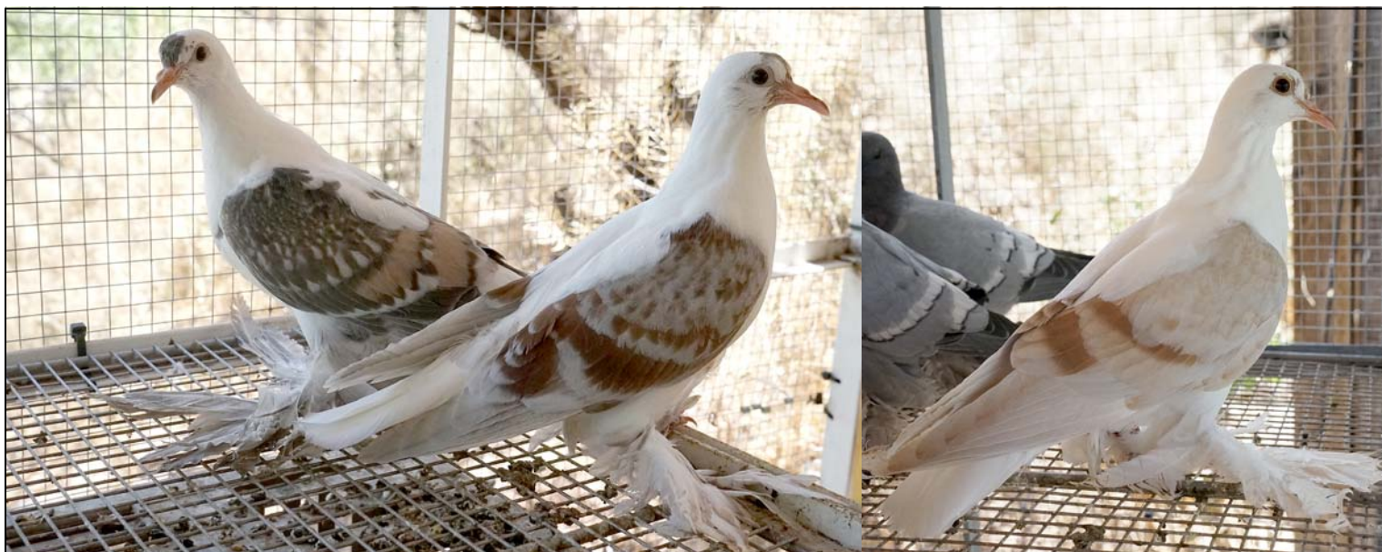
From Gary Romig, I've got baby Swallows. I am not sure what they will look like. On the left is a young silver/gold spangle. It could get better or worse with the moult. In the middle a very young red check. I am very short on hens in the red checks. On the right a cream yellow bar... a hen for sure having come from red parents. I hope all Swallow Club members are doing well and raising some good young ones

I still have a few USC bands to sell. I have only 30, 8 mm I think about 200 muffed 11 mm for sale