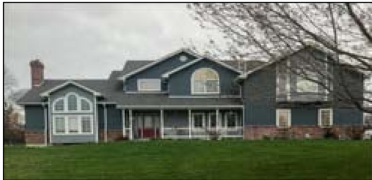
Kaylee's childhood home located next to lake. Oak Grove, Missouri

What's your least favorite part of the hobby? My least favorite part of the hobby is pairing up birds. I'm a chronic over thinker and can manage to spend hours in a freezing cold loft trying to make decisions on something that is 60% knowledge and 40% luck