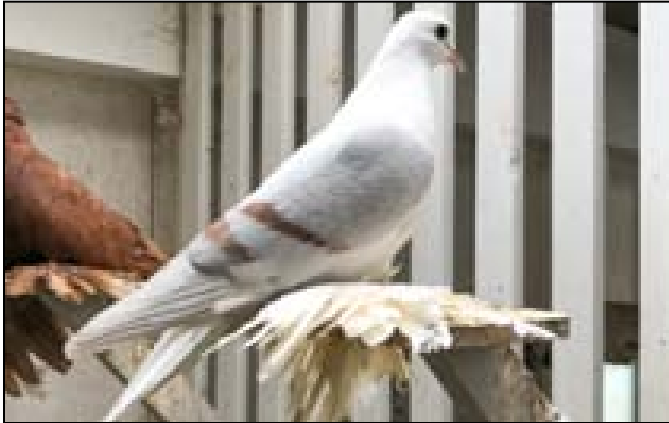
Kaylee's Ash red bar Saxon Wing Pigeon