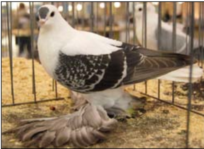
Kaylee's Silver check Saxon Wing Pigeon