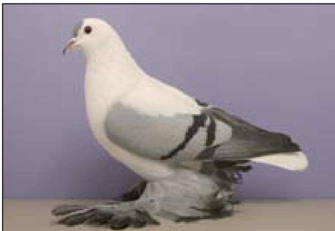
Kaylee's blue black bar Saxon Wing Pigeon.

My other suggestion is regarding judging. While I understand that maybe we have an emotional attachment to European style judging, I feel that it is too subjective. One judge may value color over type, or vice versa. Even while judging against our standard, too much subjectivity is involved. I realized this while watching my dad's Trumpeters being judged. When it comes down to the finals, the poster board gets pulled out. Yes, the judge is still using their best judgment to award a number score to each category, but that category has a preset value. I feel like this kind of objectivity is more attractive to beginners who might not know the birds as well, and are intimidated by our current judging style. I do think that our judges typically do a good job of explaining their decisions, especially when they know the breeder would appreciate feedback