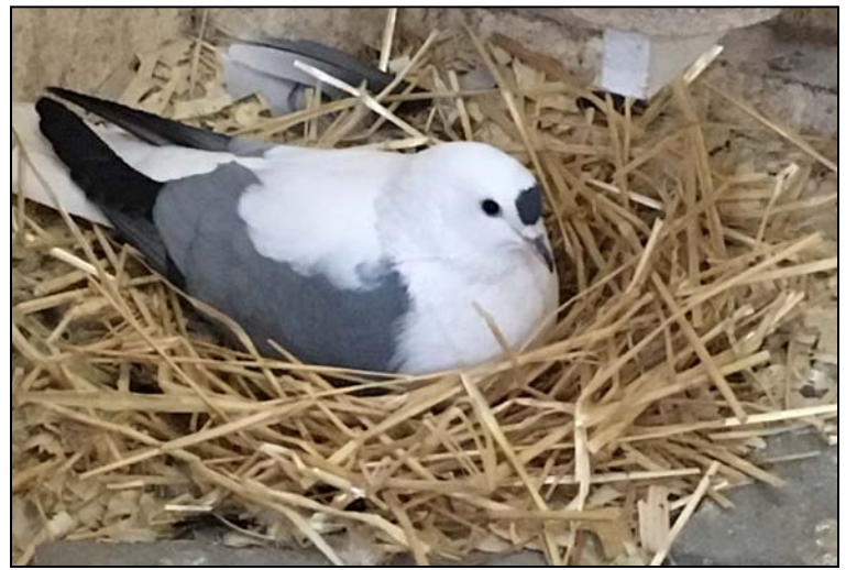
A Beautiful Nest!

Supporting Swallow Pigeons World Wide Since 1969 Newsletter No. 2, 2020