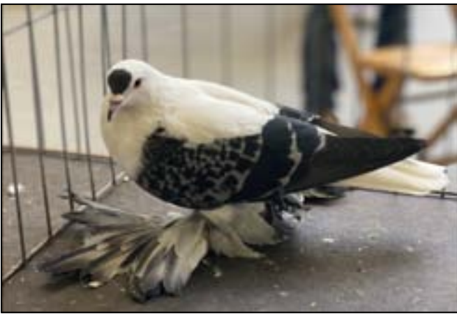
Kaylee's blue check Saxon Wing Pigeon