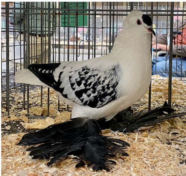
Perry Mueller Black Spangle Fairy Swallow YH 844, S95