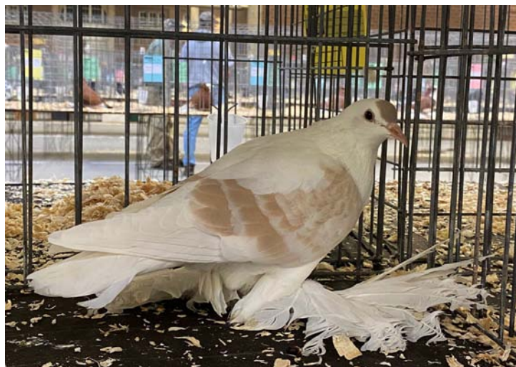
Cream Check Silesian Swallow YH 1622 rated HS96 Kaylee Quattlebaum