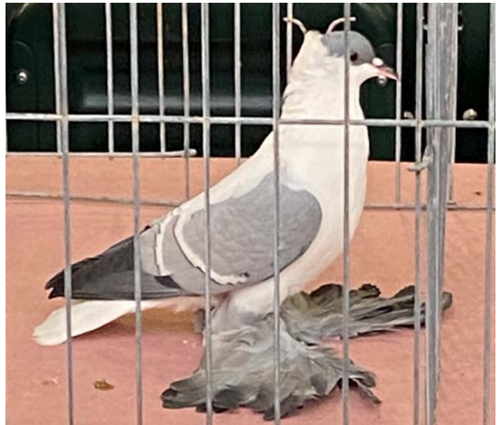
Best Saxon Fullhead Swallow Blue White Bar. YH. 847, HS96, Perry Mueller