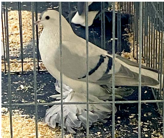
Silver Dun Bar Silesian- Young Cock HS96, 1754 Jim Grober

++ Champ and Reserve Champ were recommended for "e" rating but due to requirement in the Constitution and Bylaws that a min. of 2 certified judges are required to award a E-97 was not met the rating of HS96 was awarded