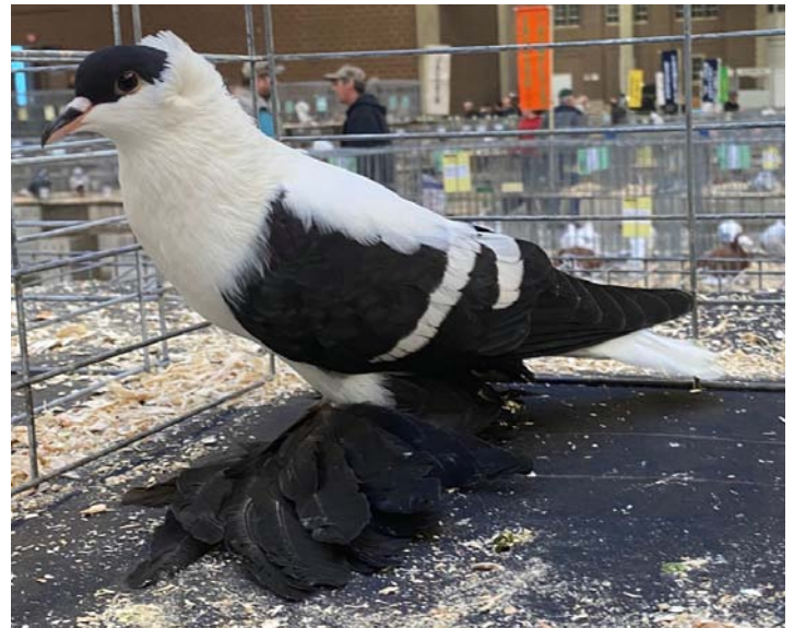
Saxon Swallow Black White Bar YC 920 Chris Auer S95