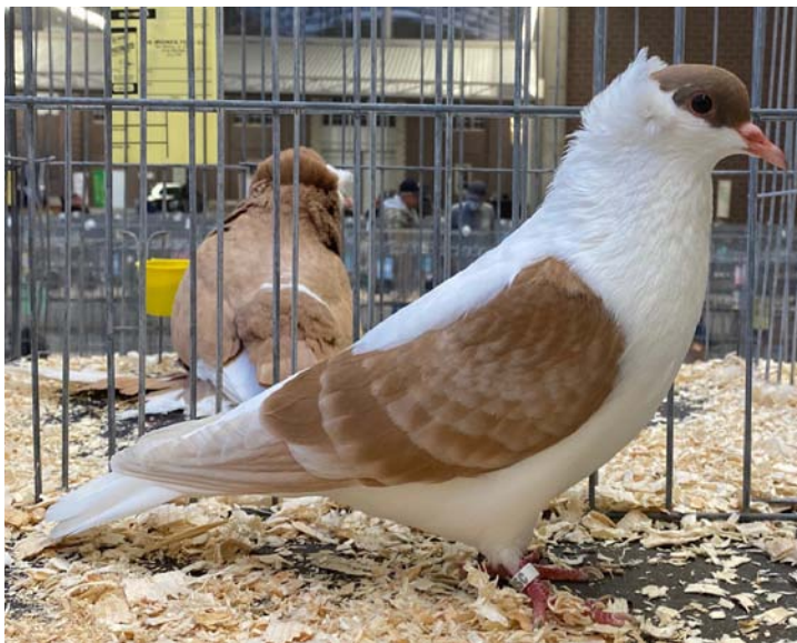
Best Thuringer Swallow, Yellow Check, YC 76, S95, Elliot Yeske