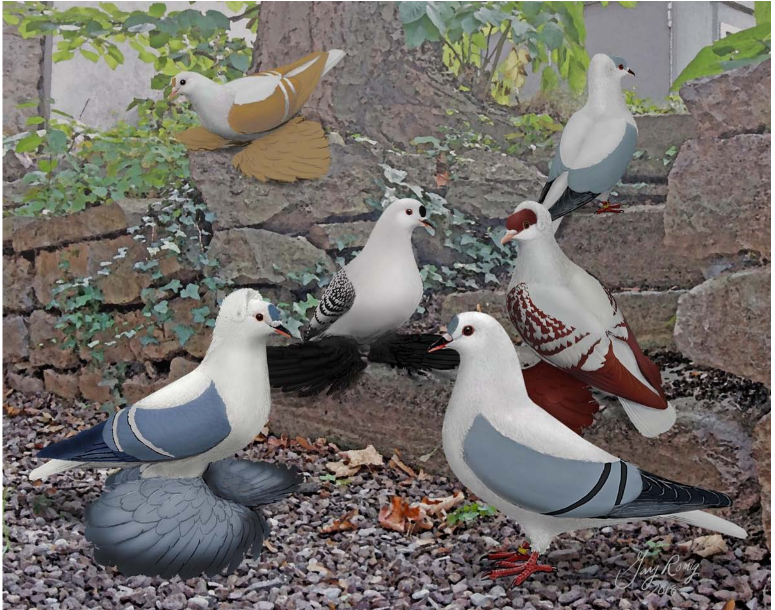
Assorted Swallows Types: Art by Gary Romig