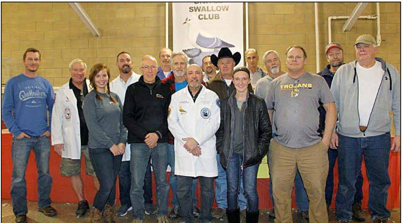
USC members at the 2016 USC annual meet in Des Moines, Iowa (Left to right):

Definitely, the Amarillo National will provide a special opportunity to celebrate our club and our breed, plan to join us!