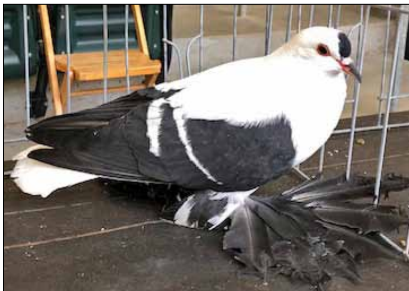
Champion Swallow, Best Silesian Swallow Black white bar YC #1204 - Jim Grober