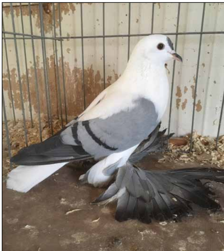
Res. Champion, Best Silesian, Blue Black Bar, YC #1445 Rated S95; Steve Ripper