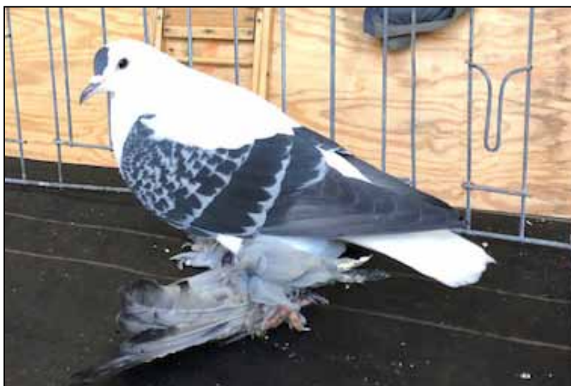
Reserve Champion, Blue Check - Old Cock Rated S95 #2330 Kaylee Quattelbaum